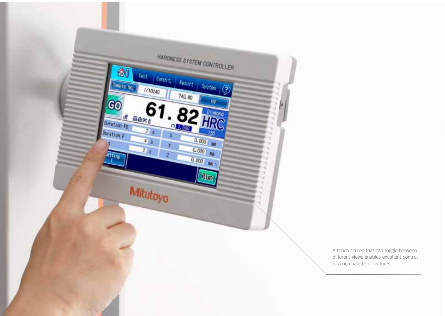
A touch screen that can toggle between different views enables excellent control of a rich palette of features.

Quality management decisions based on hardness testing of industrial materials are made using multi-point test results. The statistical analysis feature, which can calculate the maximum, minimum, average, standard deviation and other values, is useful for analyzing multi-point test results.