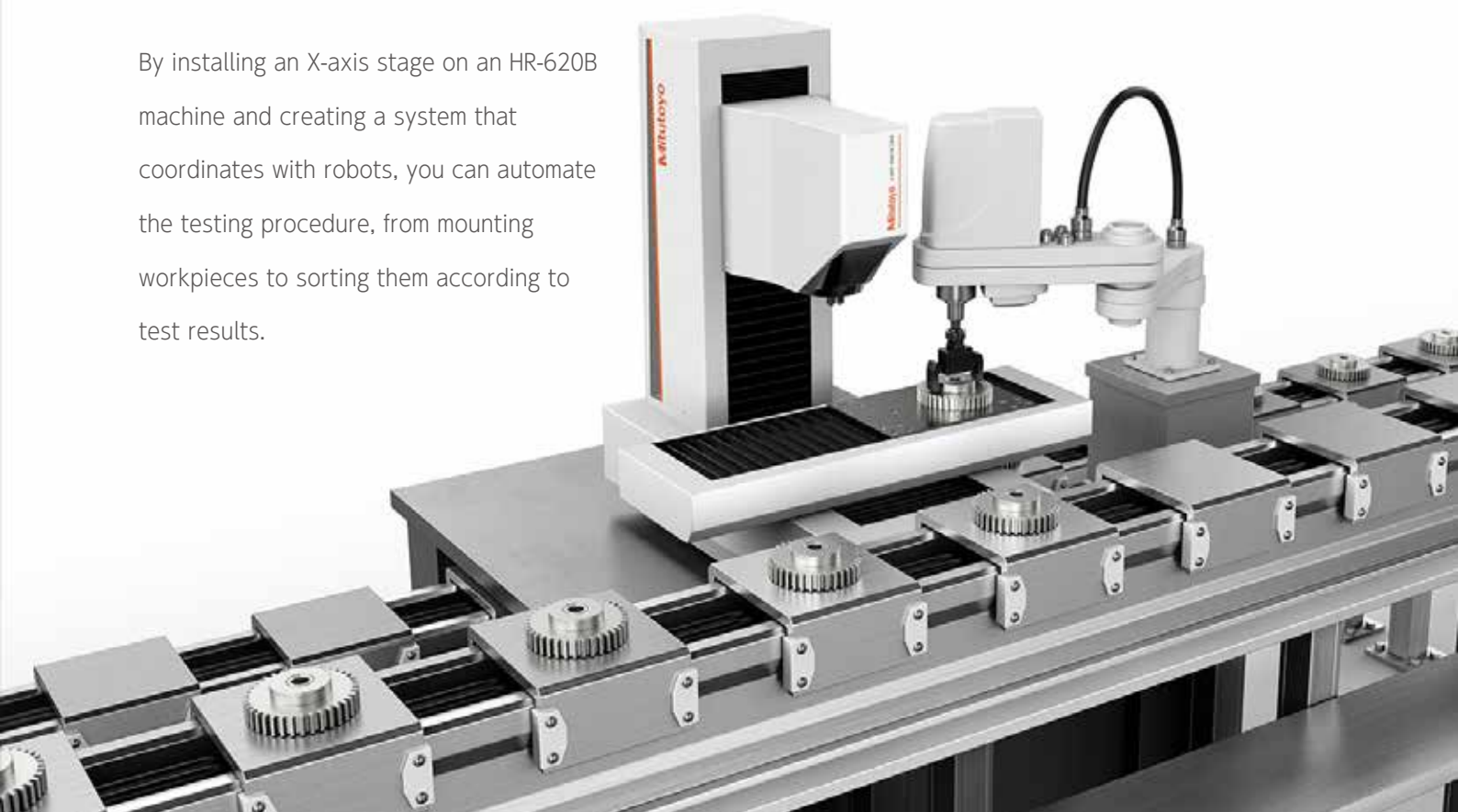
Example of Rockwell hardness testing machine automation on a production line

By installing an X-axis stage on an HR-620B machine and creating a system that coordinates with robots, you can automate the testing procedure, from mounting workpieces to sorting them according to test results.